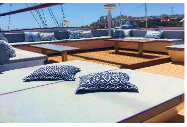
November 3, 2022